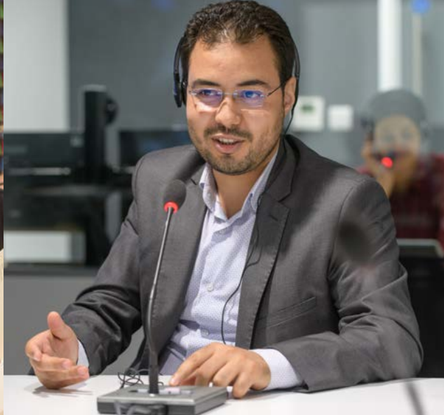
Clockwise from top-left Students seeing their work in print Interpreting suite