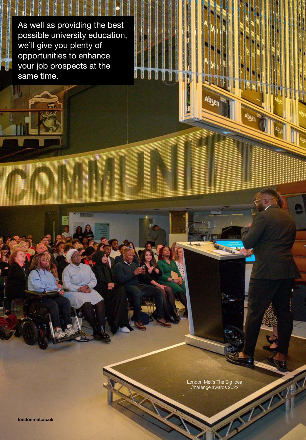
London Met's The Big Idea Challenge awards 2022

As well as providing the best possible university education, we'll give you plenty of opportunities to enhance your job prospects at the same time.