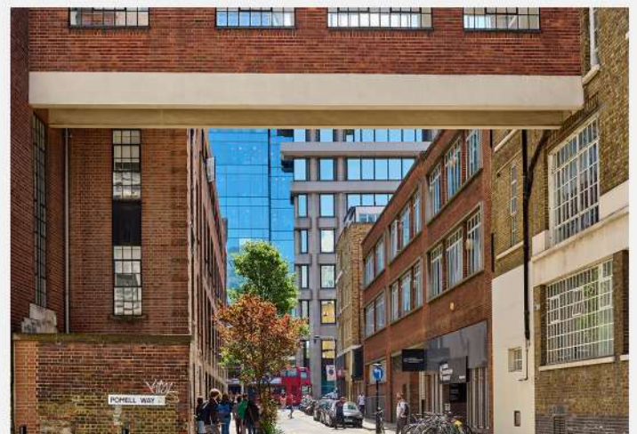
📍 Aldgate campus