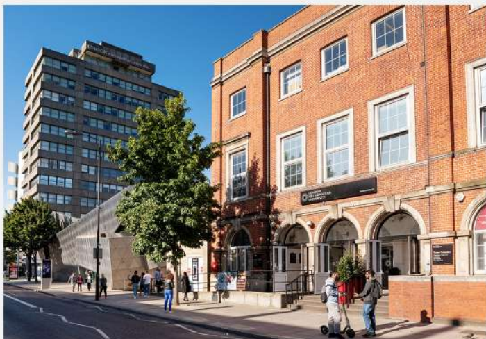
📍 Holloway campus